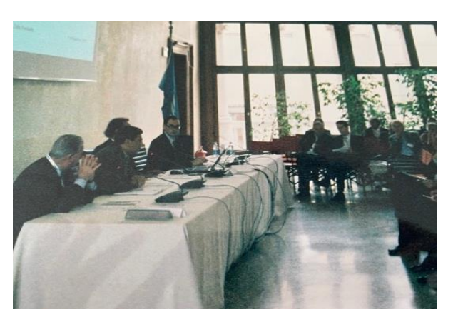
OCCAM - Observatory on Cultural and Audiovisual Communication in the Mediterranean CICT ICFT - Comitato Italiano